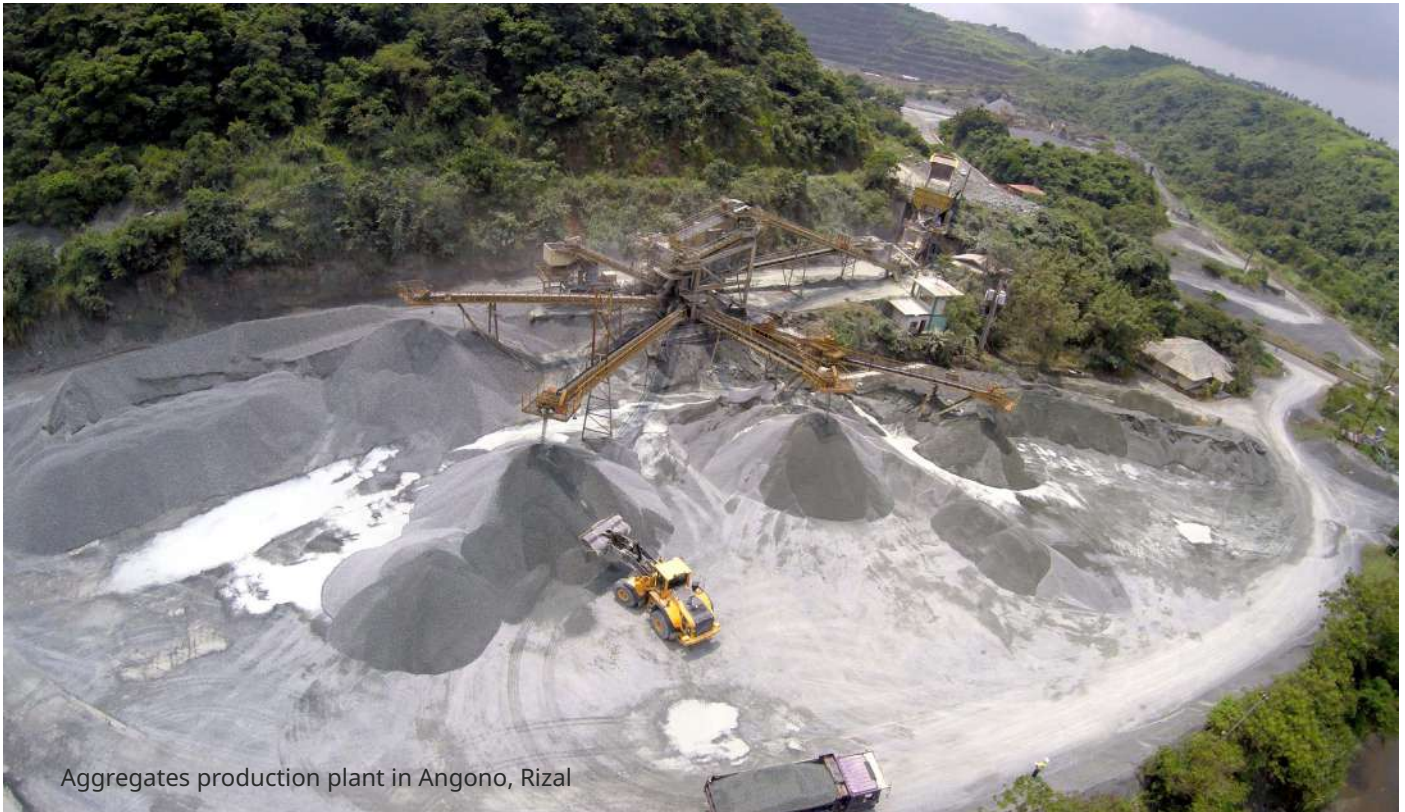
Aggregates production plant in Angono, Rizal