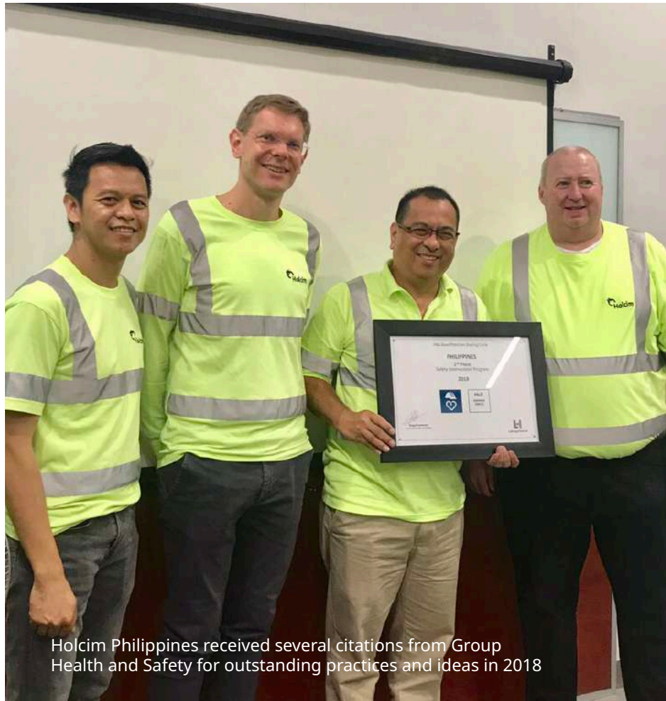
Holcim Philippines received several citations from Group Health and Safety for outstanding practices and ideas in 2018