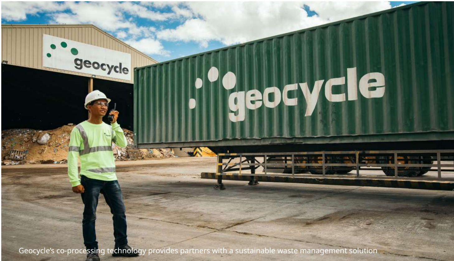
Geocycle's co-processing technology provides partners with a sustainable waste management solution