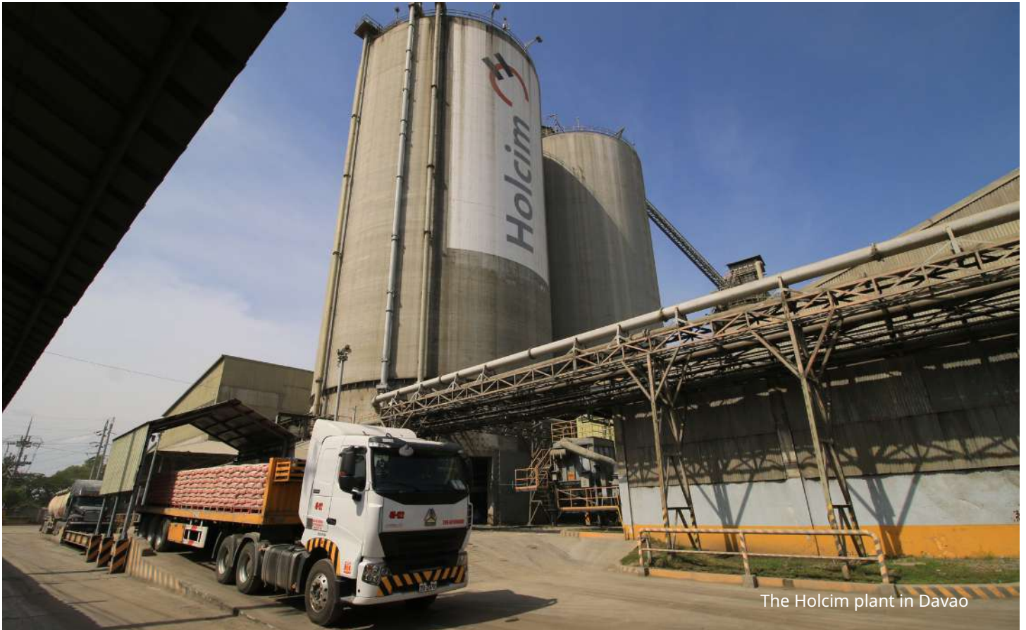
The Holcim plant in Davao