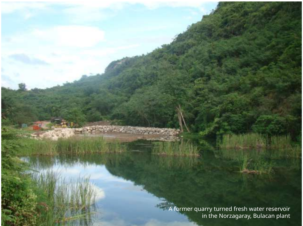
A former quarry turned fresh water reservoir in the Norzagaray, Bulacan plant

The sites are also actively engaged in the protection of freshwater resources such as nearby rivers. The plants partner with communities, local government, and the Department of Environment and Natural Resources to implement regular clean-up activities, water quality monitoring, and information education campaigns.