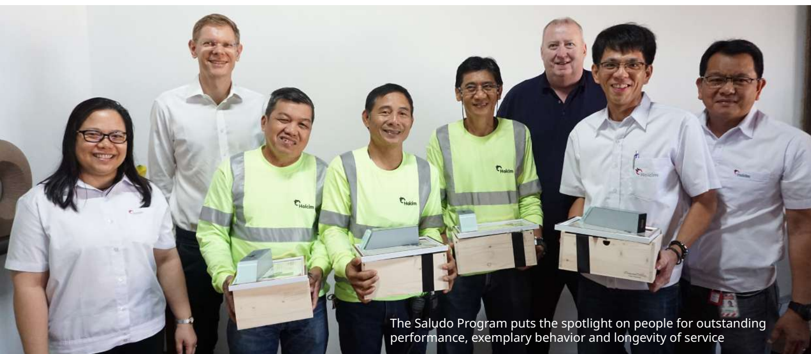
The Saludo Program puts the spotlight on people for outstanding performance, exemplary behavior and longevity of service

"Tonight we are standing on the shoulders of giants. The gentlemen we have awarded are the ones who made the commitment each day to improve our company. It's really humbling what they have done for us. Let us carry on. Take what's best from them and add to what is best from us, and continue to develop the company and make it stronger," he said. ●