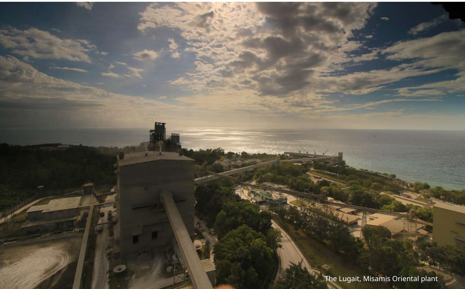
The Lugait, Misamis Oriental plant