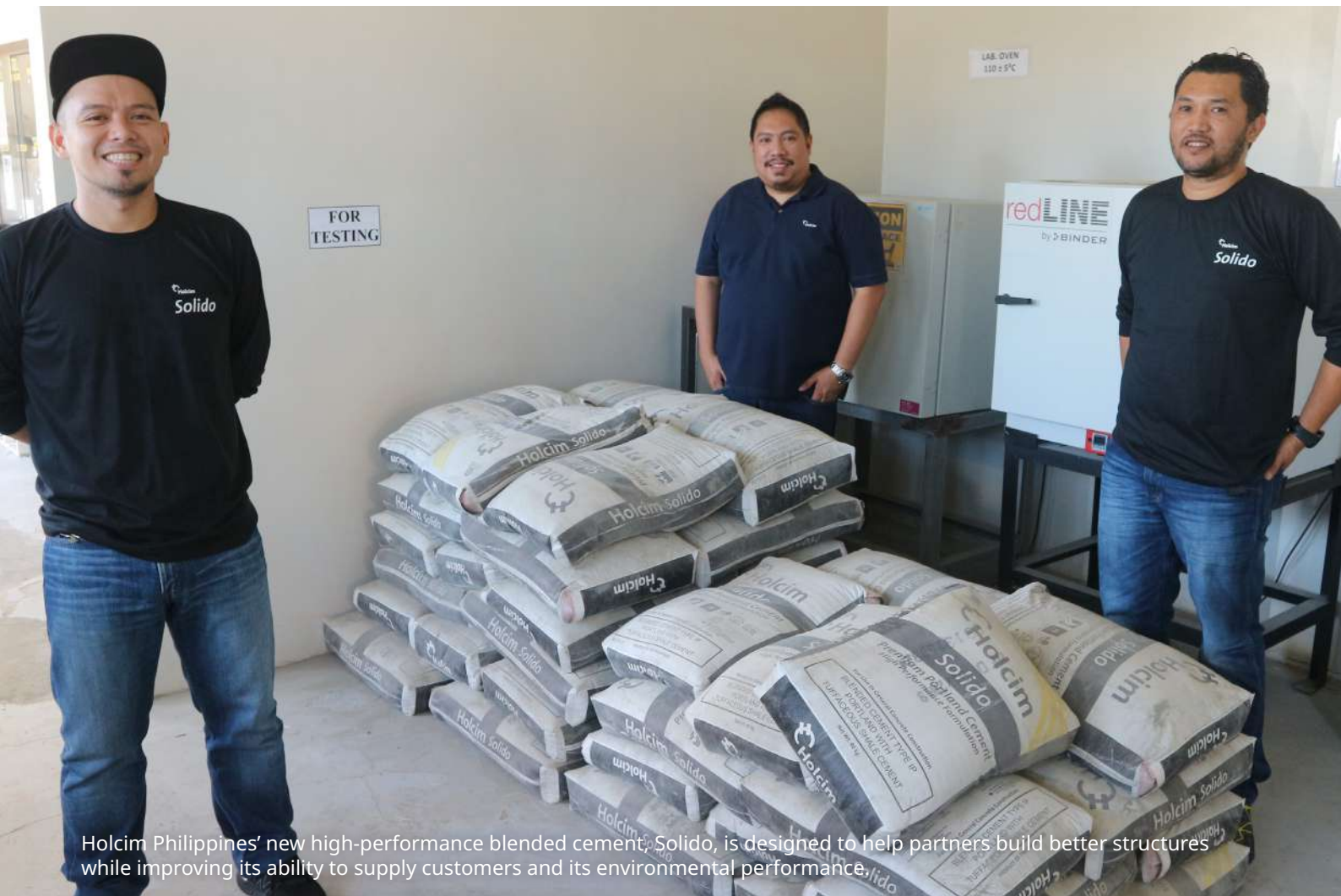
Holcim Philippines' new high-performance blended cement, Solido, is designed to help partners build better structures while improving its ability to supply customers and its environmental performance.

With these, Holcim Philippines will be able to ensure that its efforts to support the country's progress are consistent with its commitment to sustainability. The company believes that doing so makes it a better partner in building a better future for the country. •